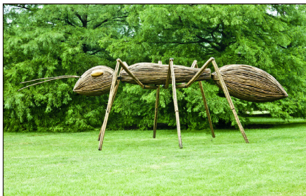
A BIG ant!